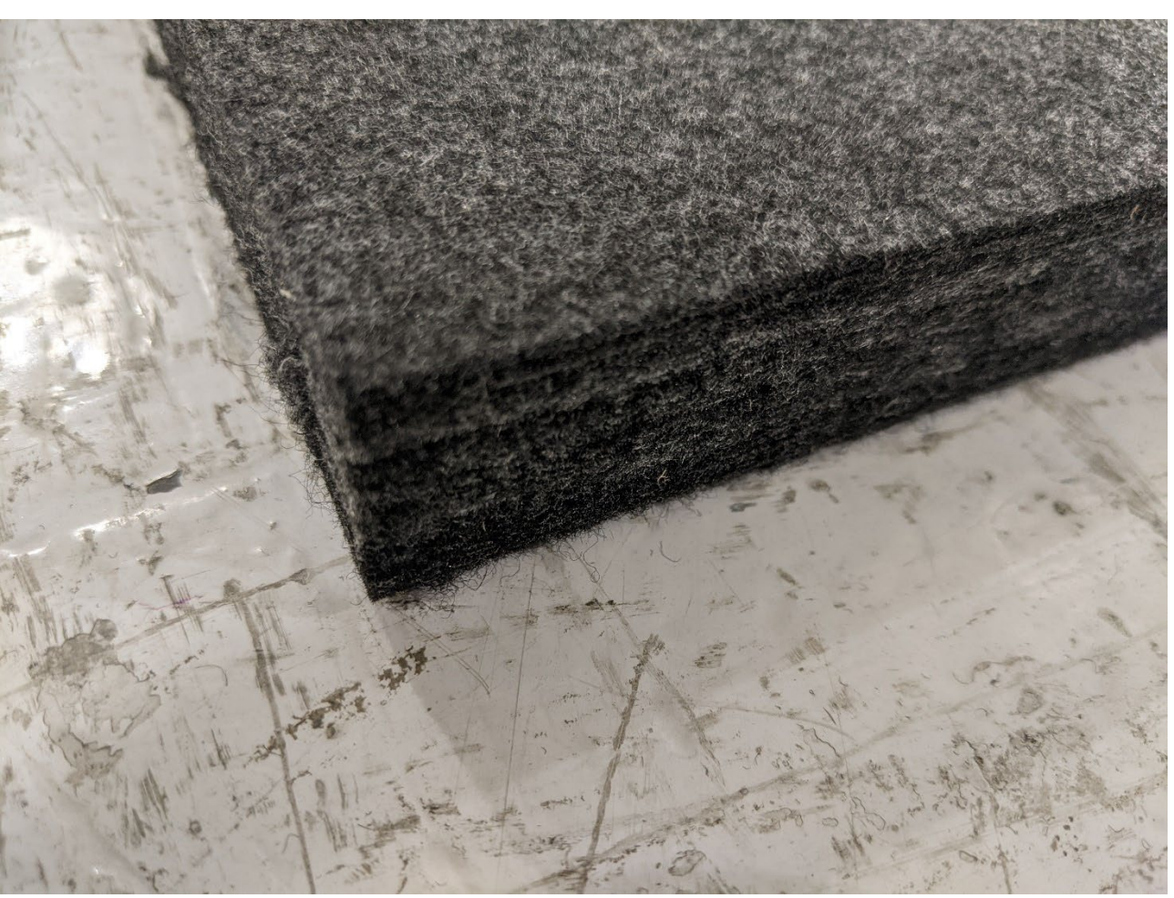
Figure 3 – Detail of specimen materials